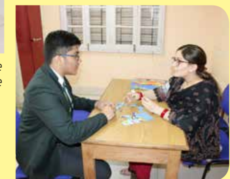
The Right Counselling